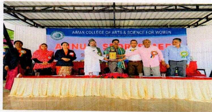
Honoring the Guest