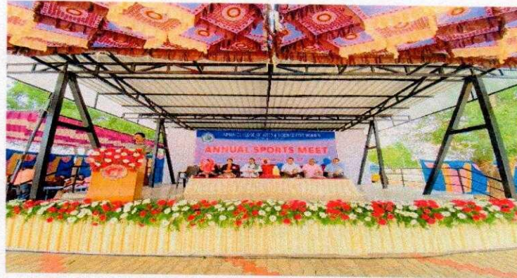
Chief Guest Address